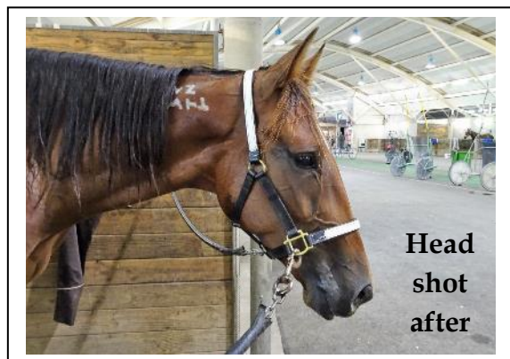
Head shot after