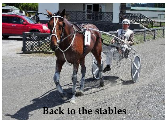
Back to the stables