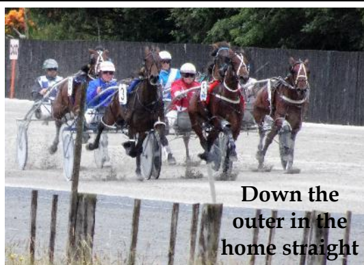
Down the outer in the home straight