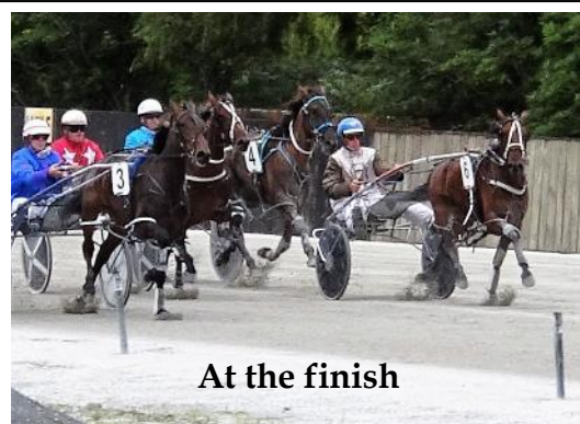
At the finish