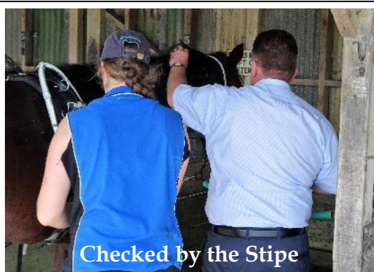
Checked by the Stipe