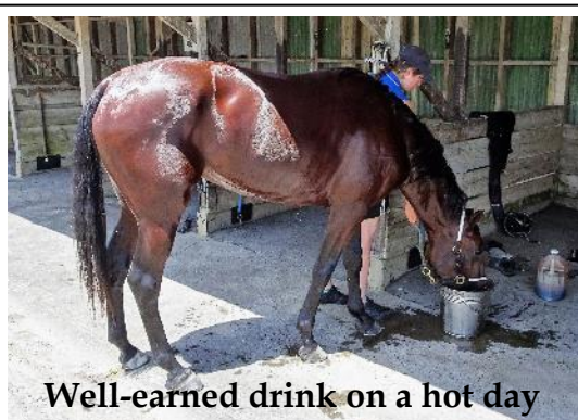
Well-earned drink on a hot day