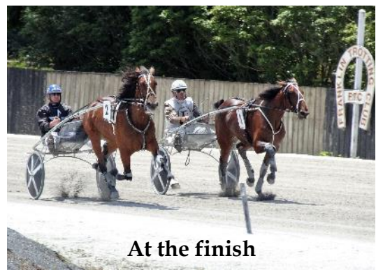
At the finish