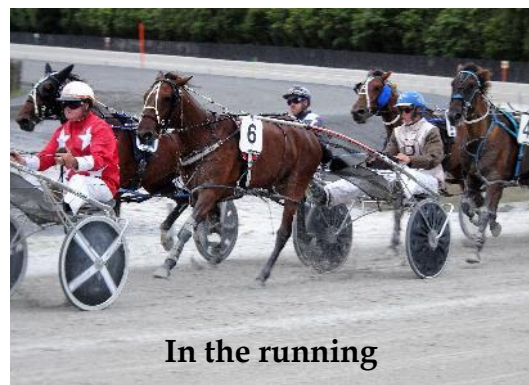
In the running