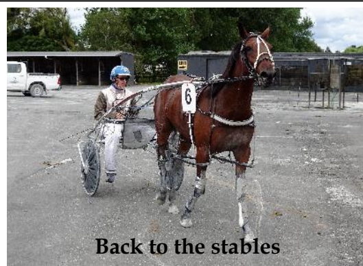
Back to the stables