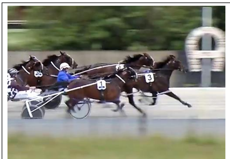
The video clearly shows Dragon Tattoo (outer) finishes in 2 nd placing ... and the camera doesn't lie

Next week the workouts are scheduled for Monday, the 21 st January, instead of the usual Tuesday meeting, so once details are available for these workouts, I will confirm these to you by the usual email.