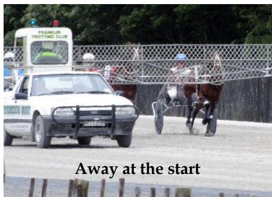
Away at the start