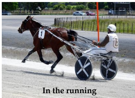
In the running