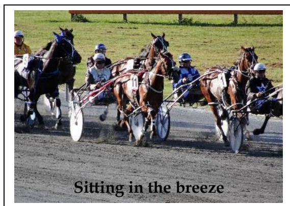
Sitting in the breeze