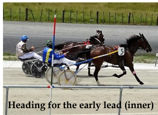
Heading for the early lead (inner)