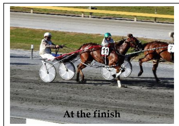
At the finish