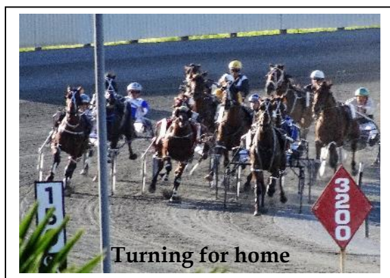
Turning for home