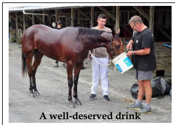
A well-deserved drink