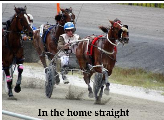
In the home straight