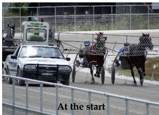
At the start