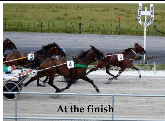
At the finish