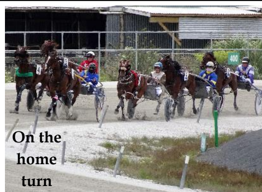
On the home turn